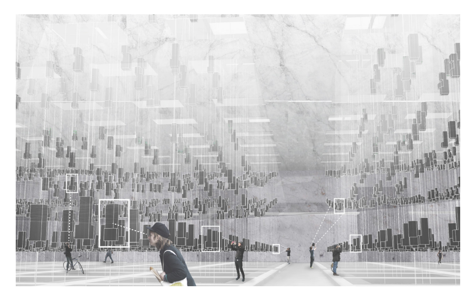
materialization of the essence of architectural forms