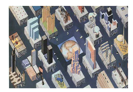
city of a global captive, Rem

The final influential precedent worth addressing is Rem Koolhaas's image: City of the Global Captive. The image is a supplementary image to Rem's notion of the grid system in New York. Each block in turn follows rigorous building setback restrictions but in relationship to each other become islands of diverse conditions. Each block island can house entirely new programs and social behaviour, making New York a truly flourishingly rich and diverse global city. The grid system was adopted in The Collector project to house the architectural forms. It was appropriate to consider each module as the abstract context of the form, relocated and situated on a common plane for comparison. The grid system in turn also allows for a rigorous but diverse set of circulation paths.