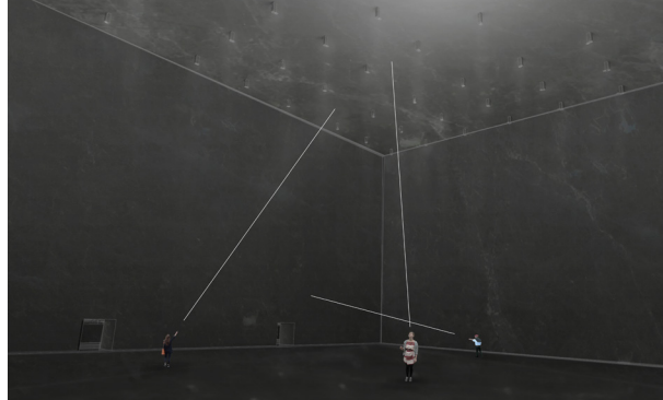
cenotaph section drawing